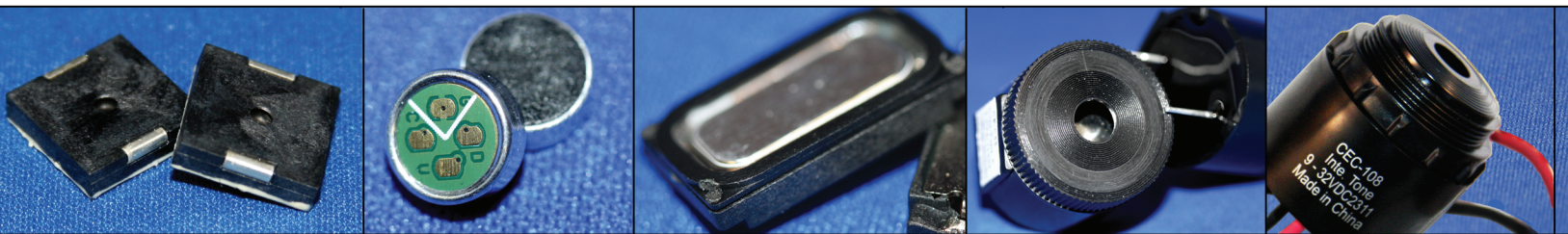
▶ SMD TRANSDUCERS

Challenge Electronics makes general purpose and special purpose sound transducers. We can make electromagnetic and piezoelectric components with the full range of mounting and termination options. Our transducers are also available for harsh environments, hermetically sealed with corrosion resistant diaphragms (IP-68) and rated for extended temperatures.