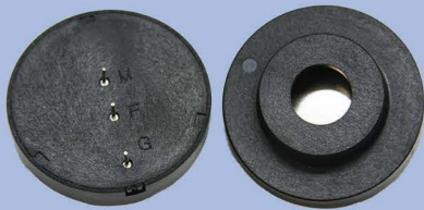
CT40P-16T325-2 Diameter: 40 mm Frequency: 3250 Hz