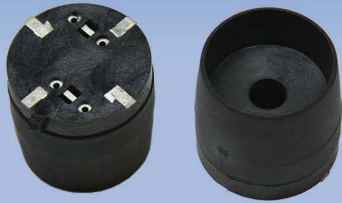
CT23P-30S320-2 Diameter: 23 mm Frequency: 3200 Hz