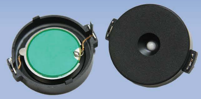
CT32P-50T325-1 Diameter: 32.5 mm Frequency: 3250 Hz