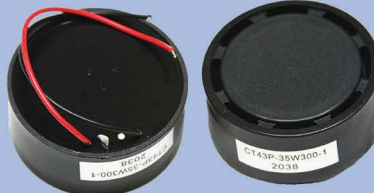
CT43P-35W300-1 Diameter: 43 mm Frequency: 3000 Hz