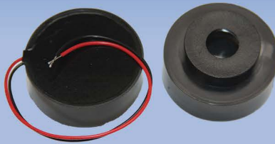
CI30P-28W325-C-1 Diameter: 30.6 mm Frequency: 3250 Hz